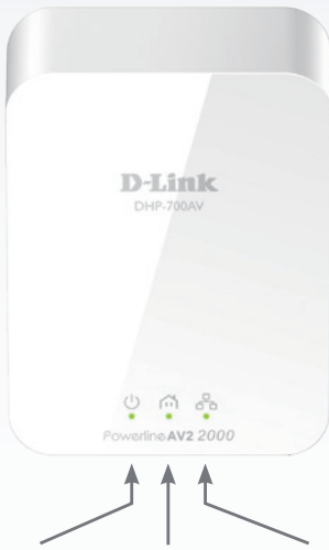
Power LED PowerLine LED Ethernet LED

The DHP-701AV incorporates a power saving mode that automatically places the adapter in sleep mode if no data transmission or reception occurs over a certain period of time, reducing power usage by more than 85%. This helps you save energy automatically without sacrificing performance.