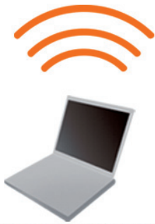
INTEL® WIDI-ENABLED LAPTOP PC