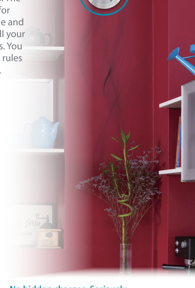
No hidden charges. Seriously.

mydlink Home allows you to start with a single smart device and add more when you want to. The unique mydlink Home App for iOS and Android smartphone and tablet gives you control of all your other mydlink Home devices. You can even set up automation rules to make your home smarter.