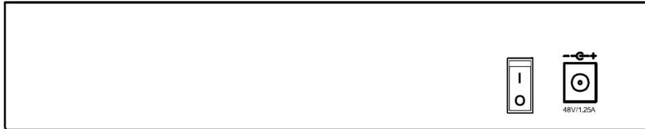
Figure 2 – DGS-1008P Rear Panel

DC Power Jack: Connect to the power adapter.